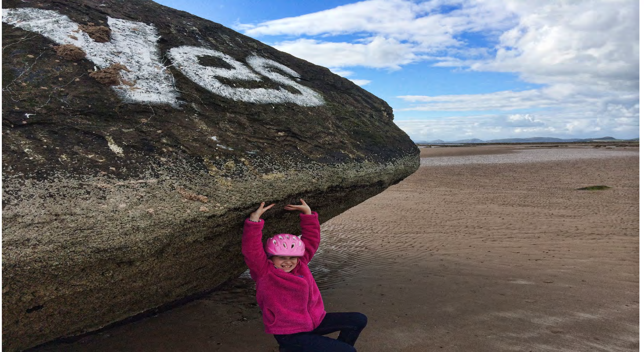
Sydney Catholic Schools Performing Arts