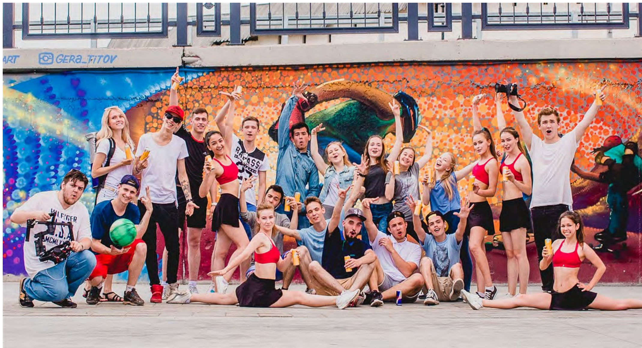
Sydney Catholic Schools Performing Arts